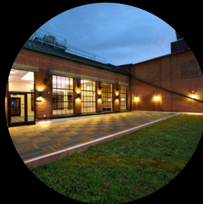
EVENT VENUE RENTAL SPACE