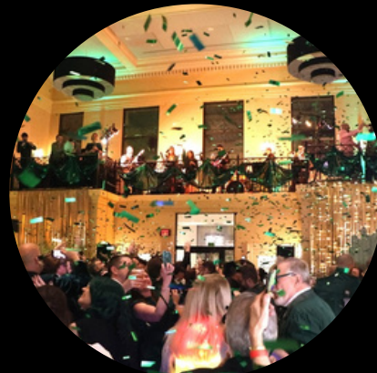
FILM AND LIVE EVENT SPONSORSHIP