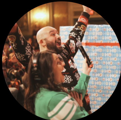
EMAIL AD SPACE